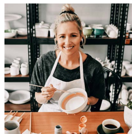
THE "SIDE HUSTLE OR PART-TIME GIG" MOVEMENT