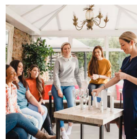
DIRECT SELLING/ LEVERAGED SALES